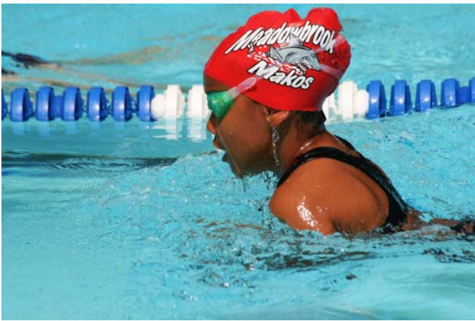
...and speaking of style – check out those spiffy new caps!