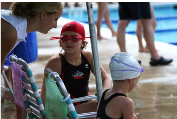
“Coach, is it really true that there is a sea lion in our swimming pool?”