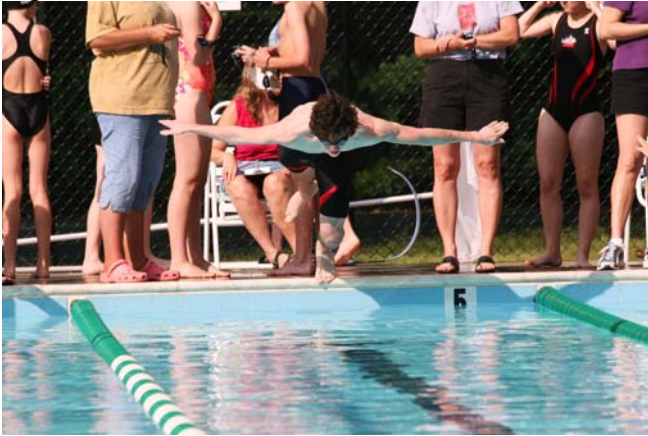
The 14U and 18U crowd continues to soar... ...as coaches keep a watchful eye on the action...