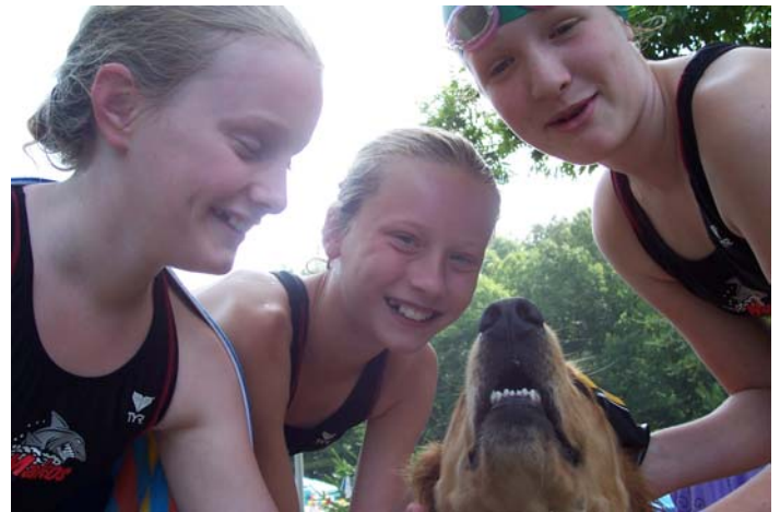
Smiling ‘tweens enjoy a moment with a four-legged friend between events at Ridgewood.