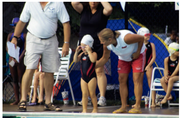
“Here I go, Mom”