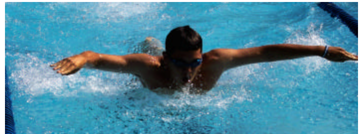
Above and below: The Makos “flew” to many personal best times over the past several weeks and appear to be in mid-summer form.

Rafael Nadal. When asked by a reporter to elaborate on his feelings prior to his last venture to Wimbledon, Agassi replied that all the hard work, training, and preparation are over: “It’s time to simply enjoy the day.” Indeed, years from now, athletes and fans are likely to remember friendships, their commitment to excellence, and the process of improvements rather than the outcome of a single event.