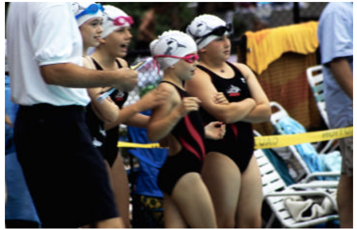
Above: “Hey, it’s a bird; no, it’s a plane; no, it’s a Mako Man! (below).